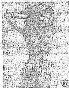
The Supreme Court has agreed to take a look at the Verga girl and other "Esquire" magazine features. The Court will rule on a 2-year argument whether or not the Post Office Department can revoke Esquire's second class mailing permit on the basis that it isn't information of a public character.